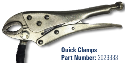
Quick Clamps Part Number: 2023333

WELDING STUDS | FASTENERS | STUD WELDING SYSTEMS